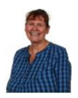
Your classroom will be in Year 2

The door you will use to come into and go out of school will be the classroom door on the Southside (near the pond).