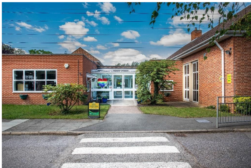
Welcome to our School