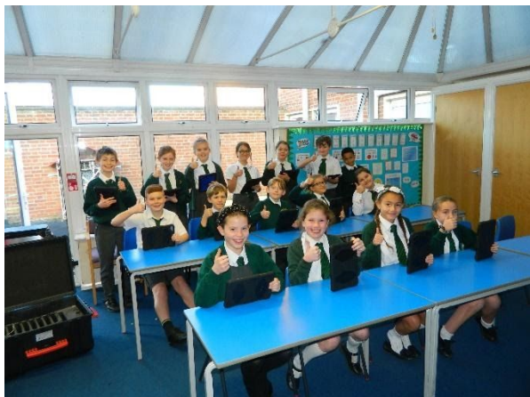
Year 5 Using the iPads

All children and parents are asked to sign our Online Safety policy when they start at school, to help to improve their own understanding of online safety issues so they can learn to use the internet and all digital media in a safe and secure way.