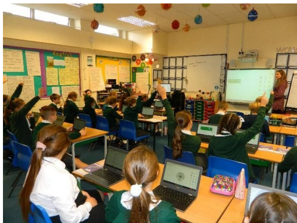
Year 5 Using the Chromebooks

All classes have Google online classrooms, allowing teachers to set work electronically for children to access remotely. This allows parents to engage with their children's learning from home and opens up channels for our staff to share work with our families via their children's Google accounts.