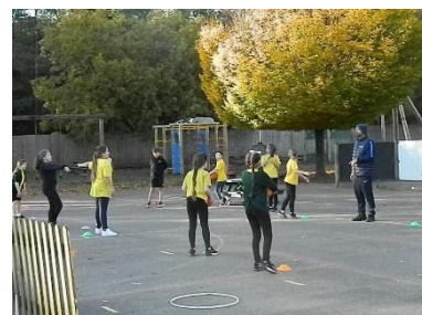
Children enjoying their P.E. Lesson